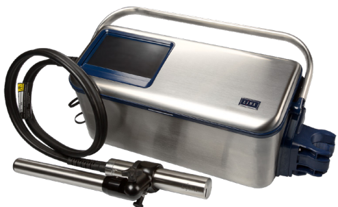
Linx 10 Date Coder (purchased as an optional extra)